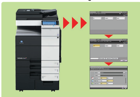
Fig 1: Select OCR options directly from MFP panel